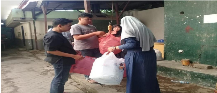
Figure II Weighing Process

The flow of the AS-SALAM transaction is first, the customer comes to the Islamic Trash Bank (BSS) with garbage, then the customer's trash is weighed and the results of the scales are recorded in the customer's savings book. Second, transfer of sharia bank savings passbooks to the RDN (Customer Fund Account) through GIS based on instructions from customers. Third, after being transferred the customer consults with GIS to be able to buy Islamic shares on the IDX (Indonesia Stock Exchange) through the IPOT GO application. Based on the explanation of the flow above, the flow can be described as follows: