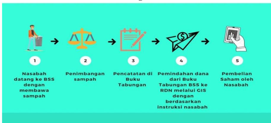
Figure III Stock Purchasing Procedure

The flow of the AS-SALAM transaction is first, the customer comes to the Islamic Trash Bank (BSS) with garbage, then the customer's trash is weighed and the results of the scales are recorded in the customer's savings book. Second, transfer of sharia bank savings passbooks to the RDN (Customer Fund Account) through GIS based on instructions from customers. Third, after being transferred the customer consults with GIS to be able to buy Islamic shares on the IDX (Indonesia Stock Exchange) through the IPOT GO application. Based on the explanation of the flow above, the flow can be described as follows: