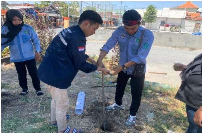
Figure 2. Soil Drilling for Biopore Planting