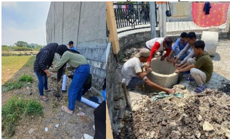
Figure 4. Installation of Biopores and Infiltration Wells in collaboration with the Blawi Village Community.

The PPK Ormawa implementation team from the Civil Engineering department of Lamongan Islamic University manages funds from the government for the purchase of infiltration pond and biopore materials. The design of the infiltration wells and biopores, as well as the supervision of the work in this case was carried out by the Civil Student Association (HMS). So the addition of 50 biopores for the entire village and the making of 7 units of infiltration wells with a diameter of 70 cm and a depth of 1.5 m can run smoothly because of the participation of the Blawi Village community and the HMS of Lamongan Islamic University. This can be seen in the documentation of photos of the results of the activity as follows: