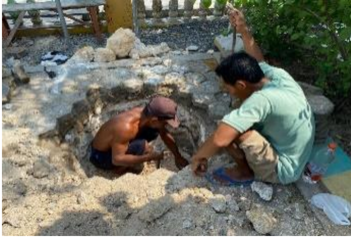
Figure 3. Infiltration Well Digging Process.