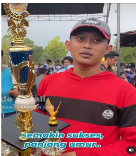
Figure 2. Minister Erick Thohir watched Karapan Sapi , Madura

The following analysis was also taken from Minister Erick's post (Figure 2).